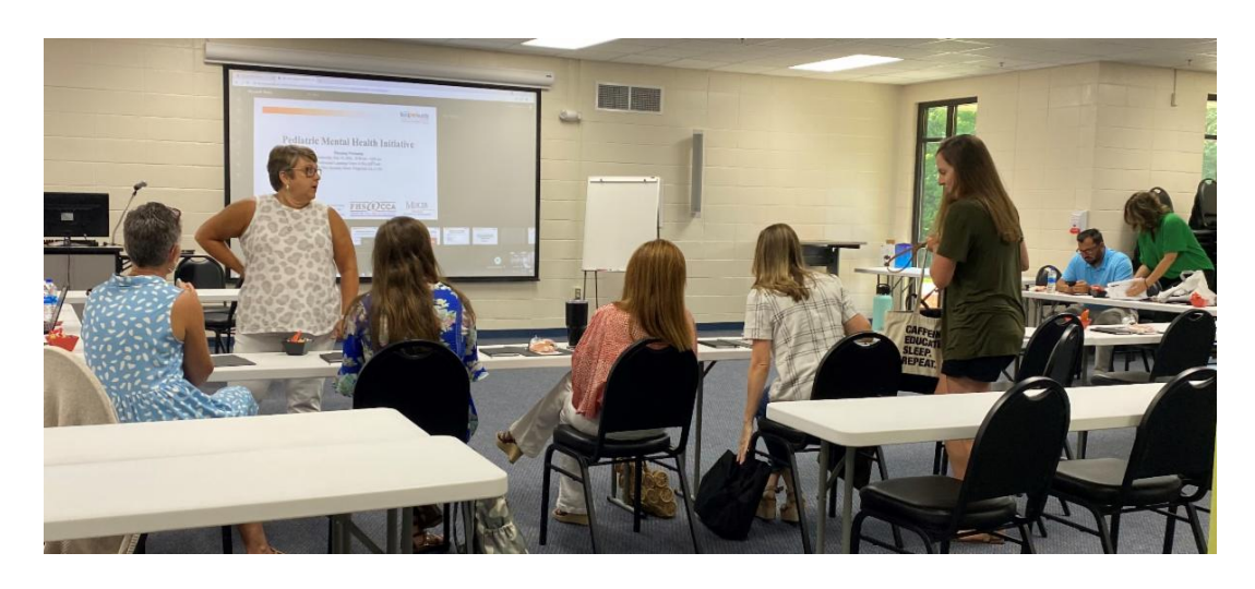
Pictured above are the participants of the Ben Hill Planning Workshop.

The Georgia Rural Health Innovation Center in collaboration with the Ben Hill County Board of Education, Global Partnership for Telehealth (GPT) and College of Professional Advancement at Mercer University, is working to develop and implement a Pediatric Mental Health Initiative. There are several components to this initiative including, but not limited to, mental health screening tools, individual, group and family counseling, assessment services via telehealth, suicide and mental health awareness training, and community wellness events such as health fairs.