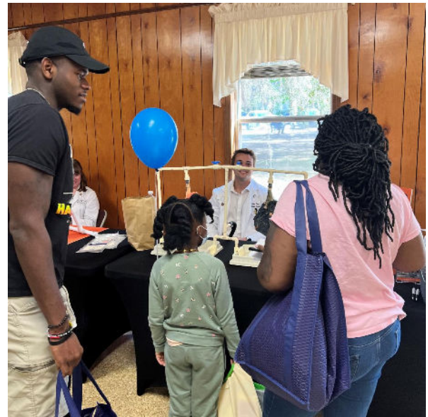
Pictured Above health fair participants at Washington County (left) and Clay County (right).